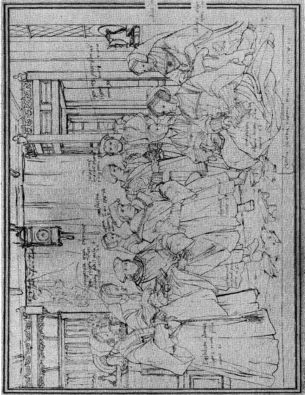
HOLBEIN, Hans the Younger: Family of Thomas More