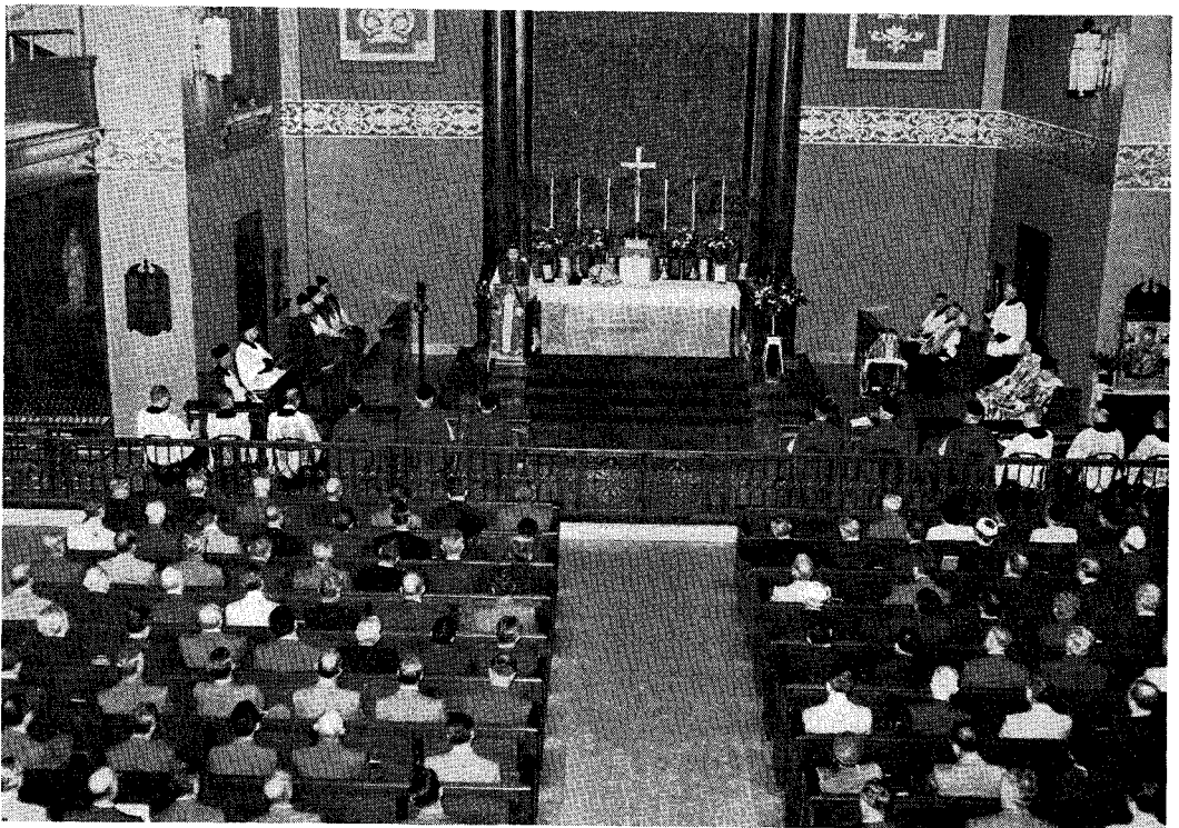
Red Mass commemorating the 25th Anniversary of the Guild (1953) at St. Andrew's Church subsequent to its renovation.