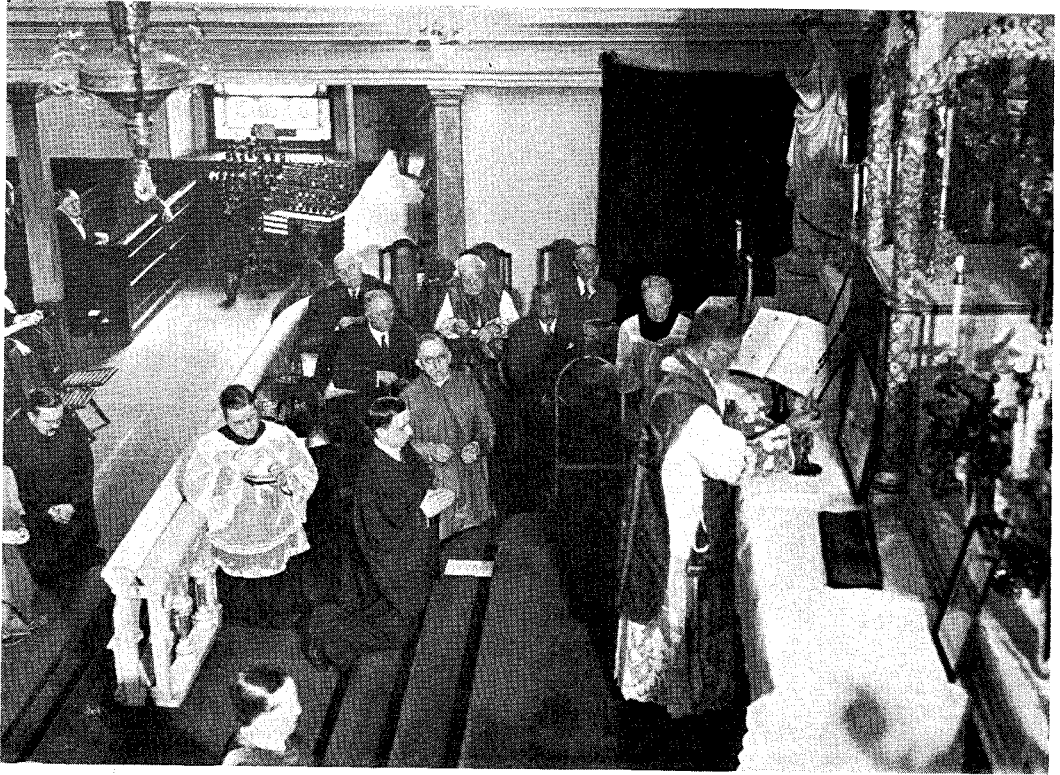
Red Mass at St. Andrew's Church (1932) prior to its renovation.