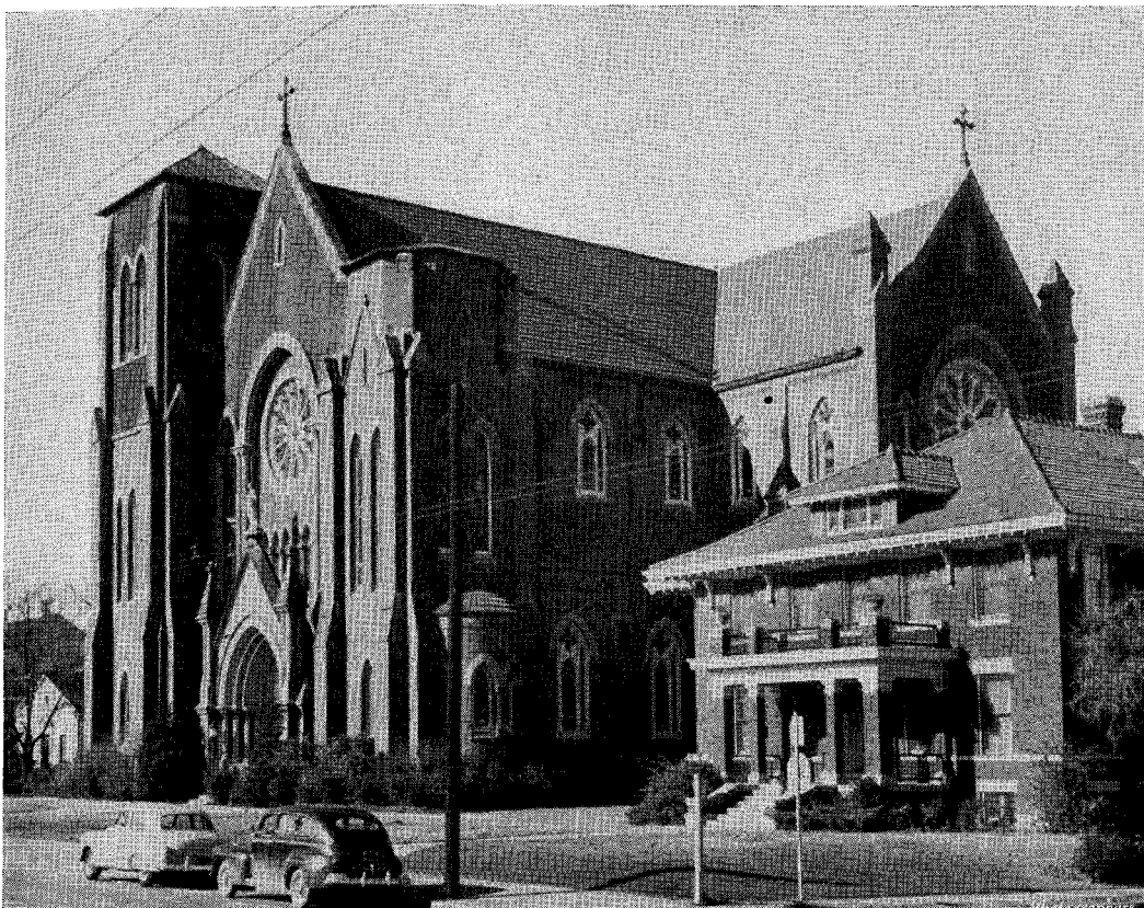
Sacred Heart Cathedral and Rectory