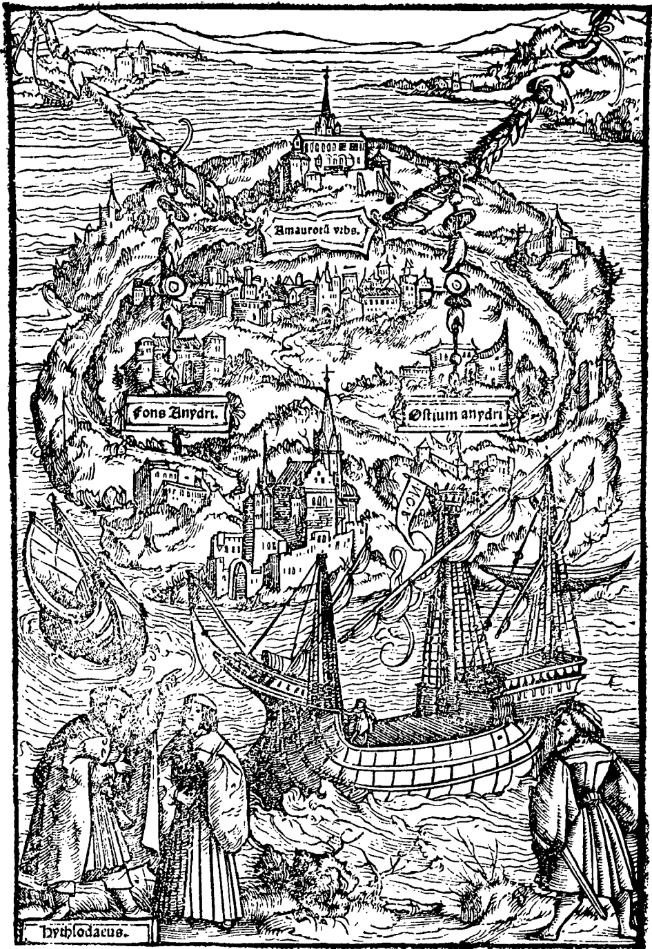
Woodcut of the island of Utopia by Ambrose Holbein, brother of Hans, who shared in illustrating the Basle edition of More's work of 1518. Newberry Library, Chicago.