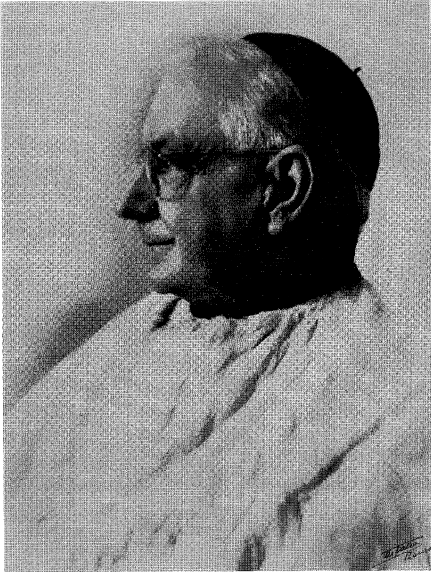
His Eminence Samuel Cardinal Stritch

shortly after his arrival in Chicago in 1940, His Eminence, Samuel Cardinal Stritch, presided at what has become the Guild's annual Red Mass. Since that time, Cardinal Stritch has repeatedly expressed and demonstrated his support of the Guild and