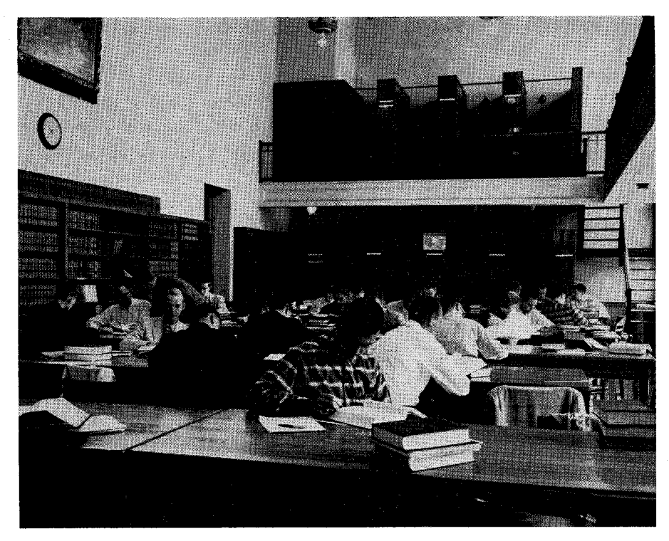
The Law School Library reading room.

valuable training in judicial administration under the watchful eye of a practicing attorney. But more important than this practical training in dealing with clients and with courts is the development of an awareness that the profession is dedicated to public service and that legal aid is the heritage and right of every citizen, rich or poor.