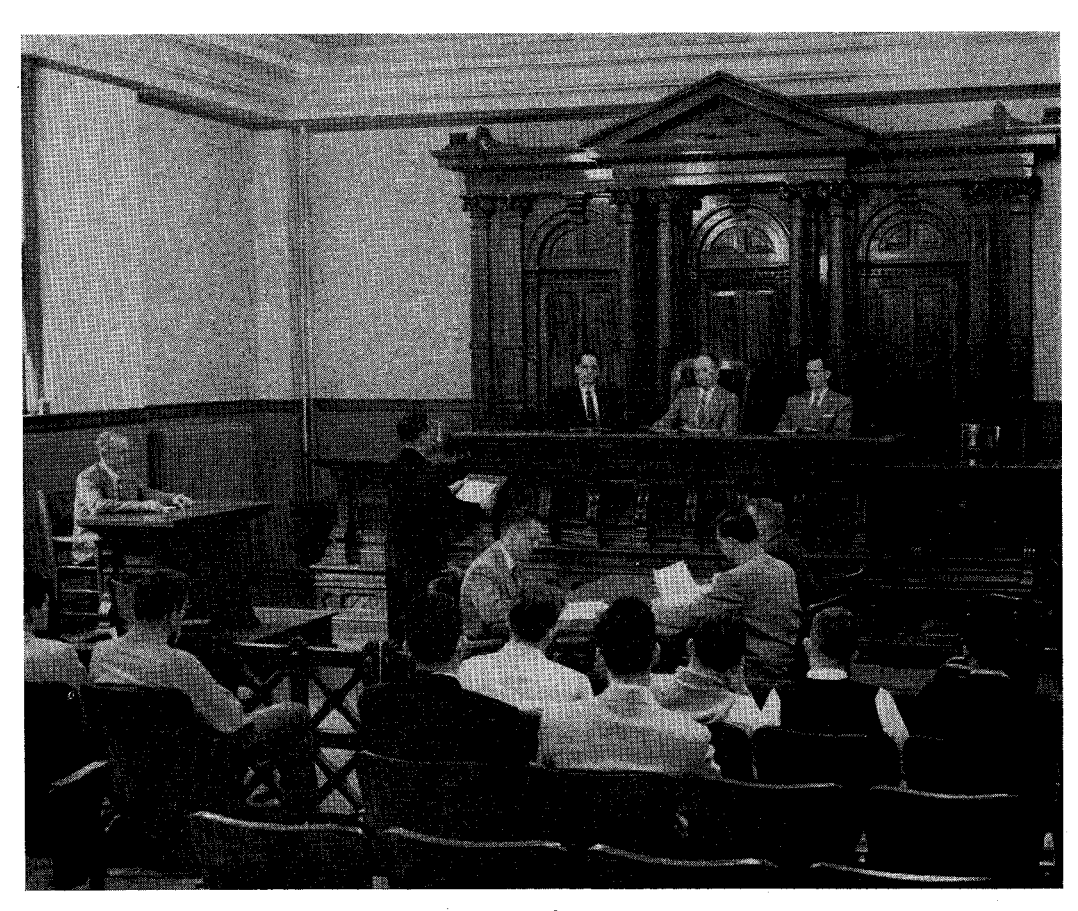
Arguing before the Moot Court.

furnish advice and assistance to persons in the community who are financially unable to afford legal aid. The office of the clinic is located in the School of Law and is generally supervised by members of the faculty. Senior students interview the clients, investigate the facts, procure evidence, and prepare all preliminary drafts of pleadings and other necessary legal instruments. The local bar associations provide attorneys who direct and supervise all cases in litigation. In this manner students acquire