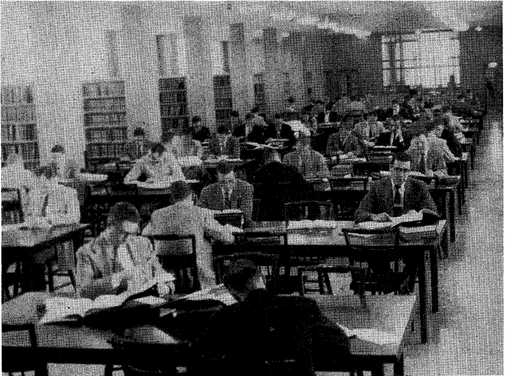
The Thomas J. Kenney Memorial Library.

The dean of the law school since June 1956, Father Robert F. Drinan, S.J., LL.M., is giving deep consideration to these proposals as are the faculty and university officials. With a dedicated faculty, a rapidly expanding library, a student body of ever greater promise and a magnificent building uniquely suited for the study of law, the future of the Boston College Law School is bright.