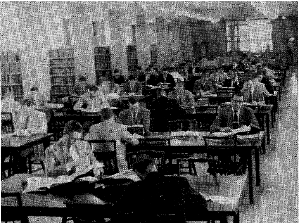
The Thomas J. Kenney Memorial Library.

The dean of the law school since June 1956, Father Robert F. Drinan, S.J., LL.M., is giving deep consideration to these proposals as are the faculty and university officials. With a dedicated faculty, a rapidly expanding library, a student body of ever greater promise and a magnificent building uniquely suited for the study of law, the future of the Boston College Law School is bright.