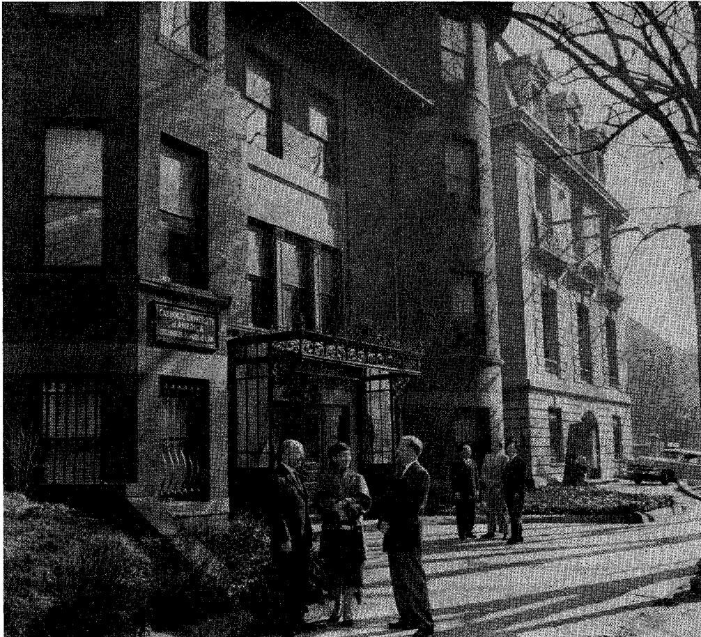
Some Members of the Faculty and Staff

Our school at The Catholic University is small, and our faculty is small. We think that a close relationship between faculty members and students helps to develop a feeling of solidarity and an appreciation of professional responsibilities. Our full-time law teachers have been practitioners and are now dedicated to the teaching of law. They know their students individually. They do not all think alike on political questions or legal issues, but they do have in common an appreciation of the profound implications and soundness of Catholic philosophy, particularly as it relates to social questions.