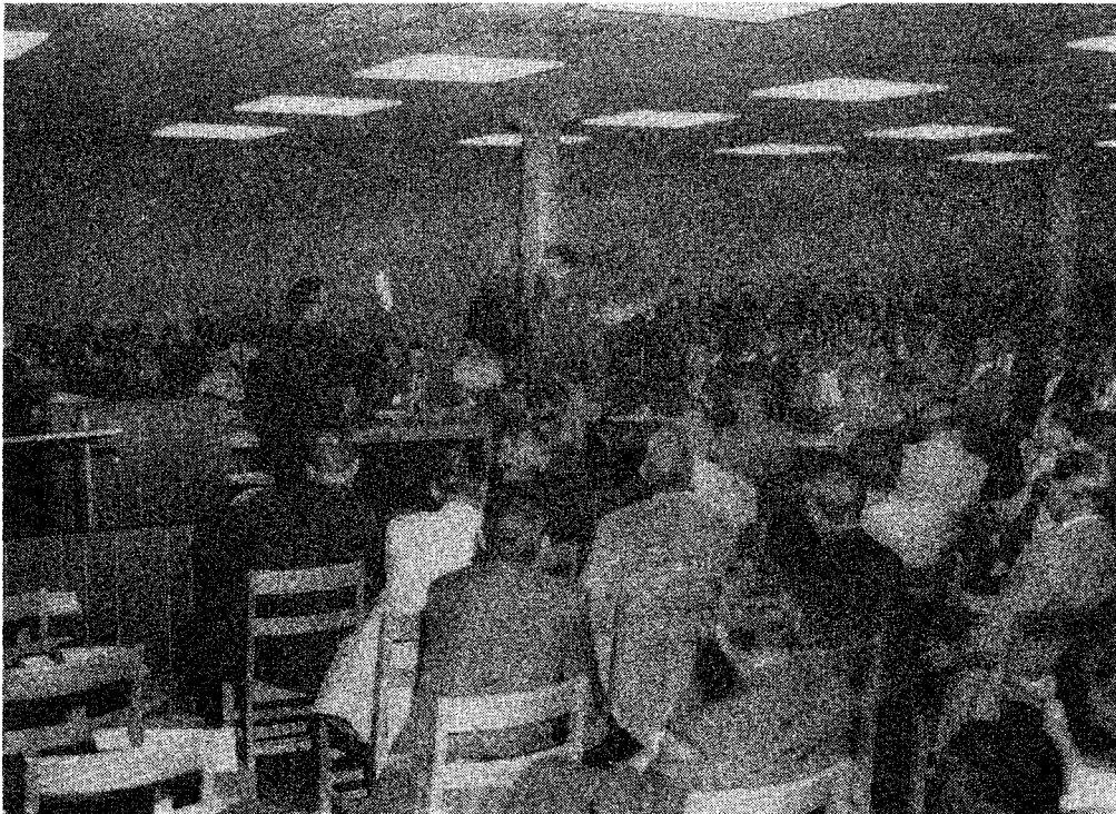
Swearing in a Witness at a Moot Court Trial

While training students in the law is the primary mission of the University of San Diego School of Law, the institution also