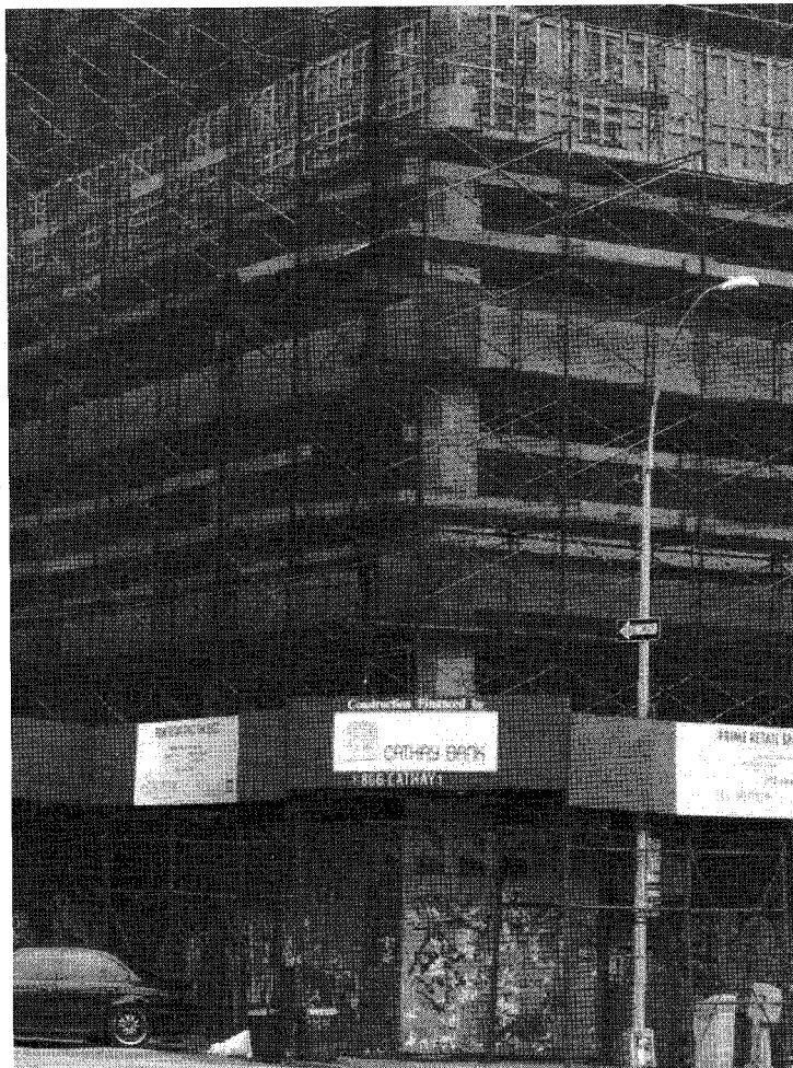
Luxury Condominium Development in Manhattan Chinatown with Cathay Bank Financing, May 2009.