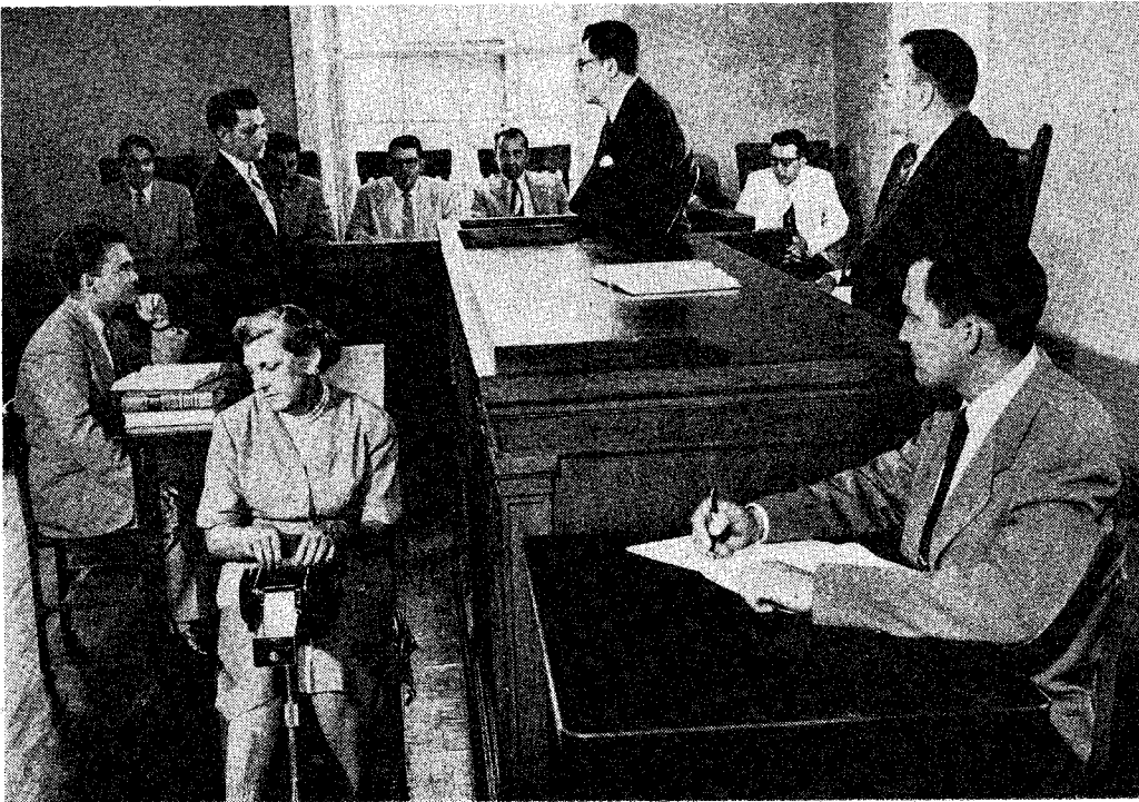
A trial under way in the Practice Court of the School of Law.