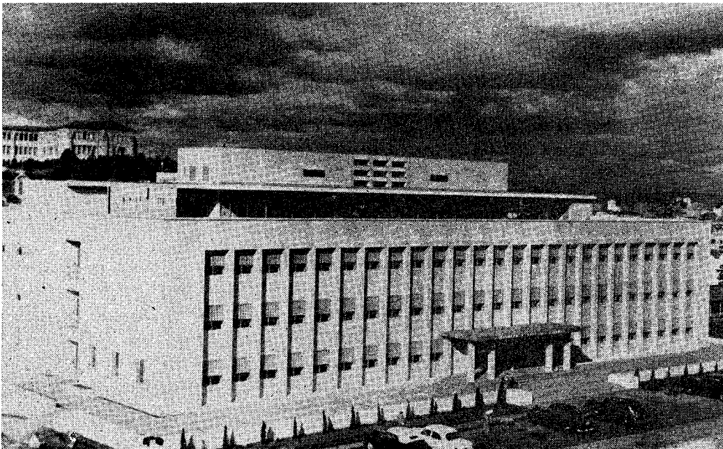
The Richard A. Gleeson Library

"We believe that liberty is a sacred thing, but that law, which regulates liberty, is a sacred obligation."